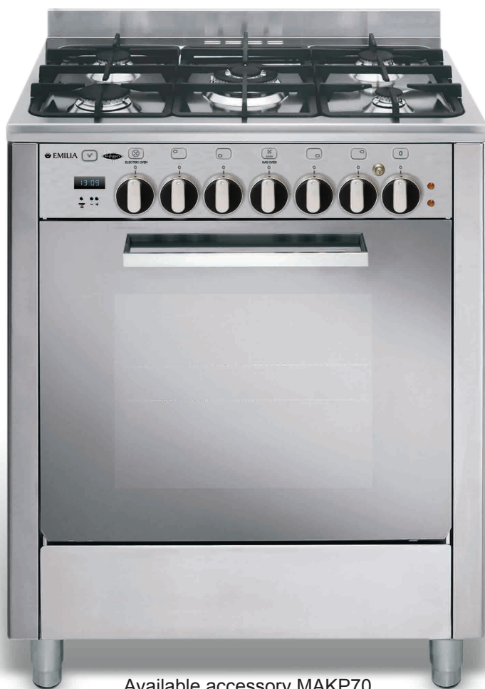
Available accessory MAKP70 140 mm Stainless steel kick panel